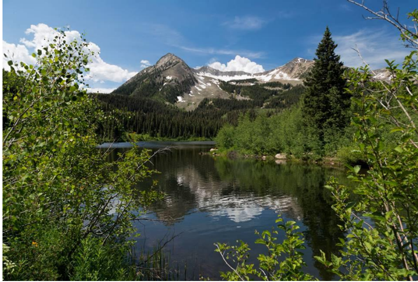
“Kebler Pass”