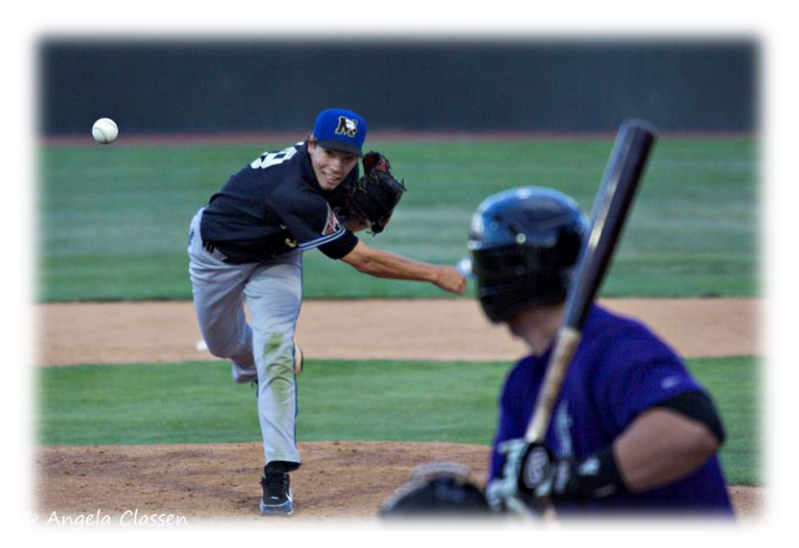
"Play Ball!"